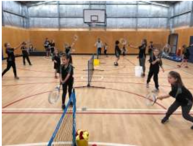
Hot Shots Tennis