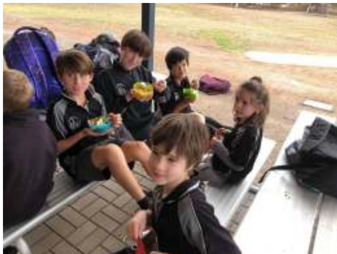
Eating our Nachos in a packet