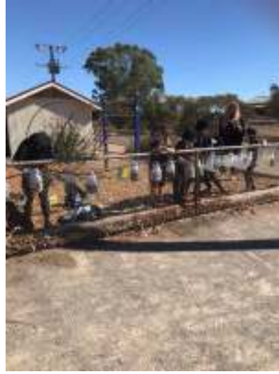
Establishing a herb garden